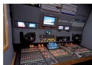
Workstation audio mixing

Further production flexibility is provided by wireless camera units with full remote controller, an EVS slow motion system and a microwave transmitter. To be prepared for every eventuality, a 40 kVA electric power generator and an UPS was integrated into the system to ensure independence from sources of electricity.