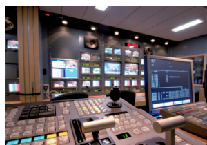
Video mixer, monitoring wall