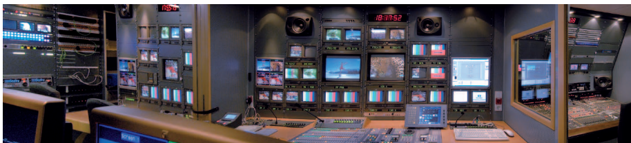
Panoramic view OB Van

Project Description: For the purpose of mid-range outside and studio productions for Kazakh-Russian Khabar TV we mounted a mobile production unit onto a Mercedes Benz AXOR chassis, allowing for flexible implementation in all kinds of sports, cultural, business or event productions. In this context, we integrated workplaces for video recording, vision control, video mixing, post-production, slow motion control and audio processing.